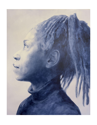
Regina H., 2024. oil on canvas, 60 x 48 inches